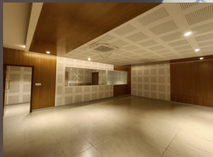
Studio Theatre for Practice