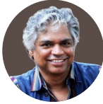
Sri prakash Belawadi Veteran Actor, Director