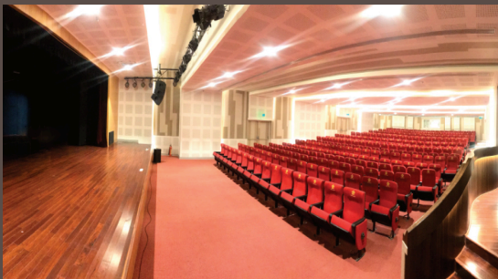
Opportunities for public showcases

YCPA offers artist-friendly learning environments